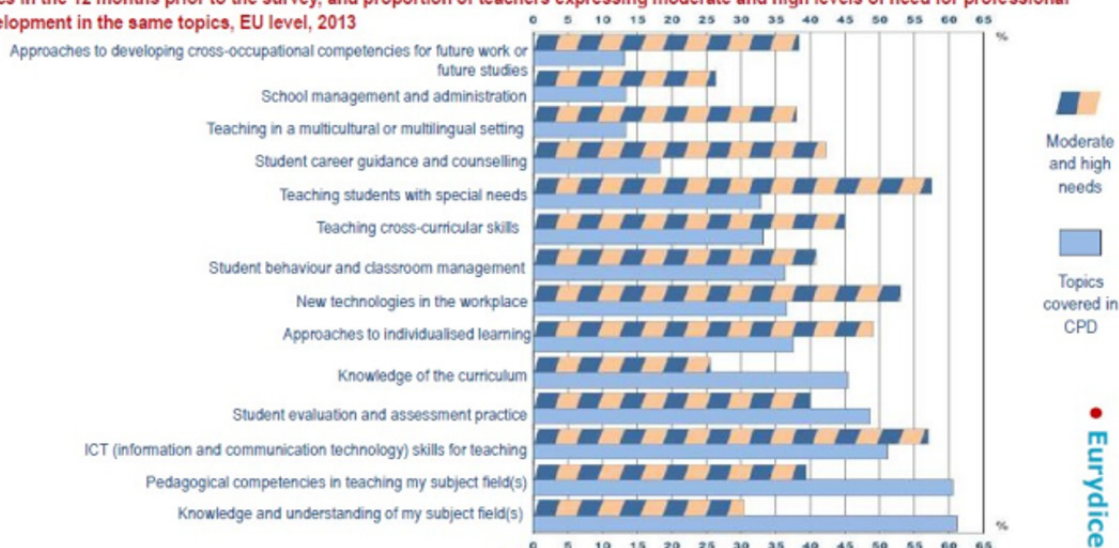
Figure 1: Status of induction programmes in primary and general secondary education FIG2.PNG

Proportion of teachers in lower secondary education (ISCED 2) declaring that their professional development activities covered specific topics in the 12 months prior to the survey, and proportion of teachers expressing moderate and high levels of need for professional development in the same topics, EU level, 2013