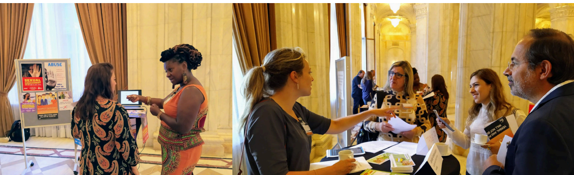
Good practice fair: Gender ambassador training in Belgium, ACV